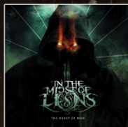
"The Heart Of Man" Cat # FCD096-2 UPC: 803847109628

Also available from In The Midst Of Lions: